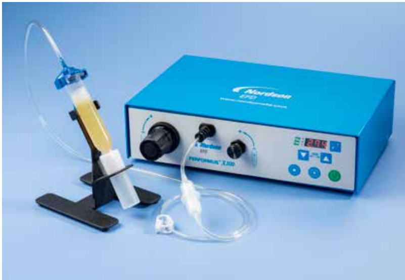
Performus X dispensers provide reliable dispensing for general applications in a wide range of industries.

Reliable benchtop fluid dispensing control for general applications