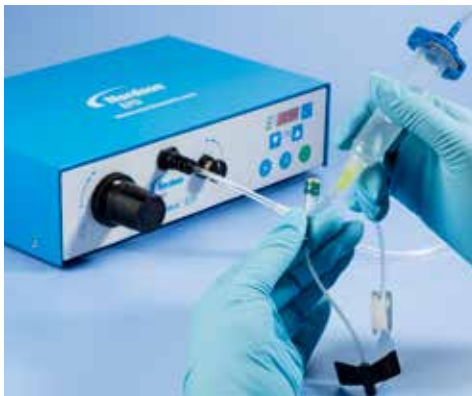
Dispensing a low-viscosity solvent on medical devices.

Nordson EFD's Performus™ X dispensers increase throughput, improve yields, and reduce production costs through controlled application of adhesives, lubricants, and other assembly fluids.