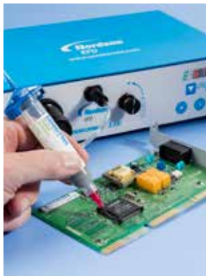
Dispensing SolderPlus® solder paste on PCB boards.