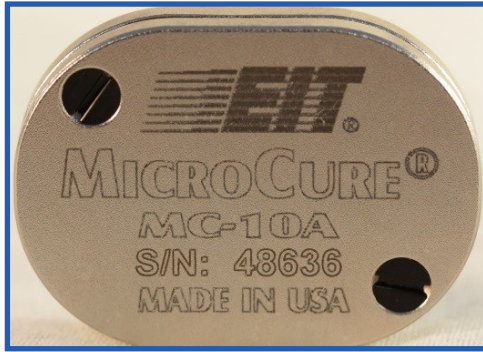
Actual size: 1.3" x 0.95" x 0.25"