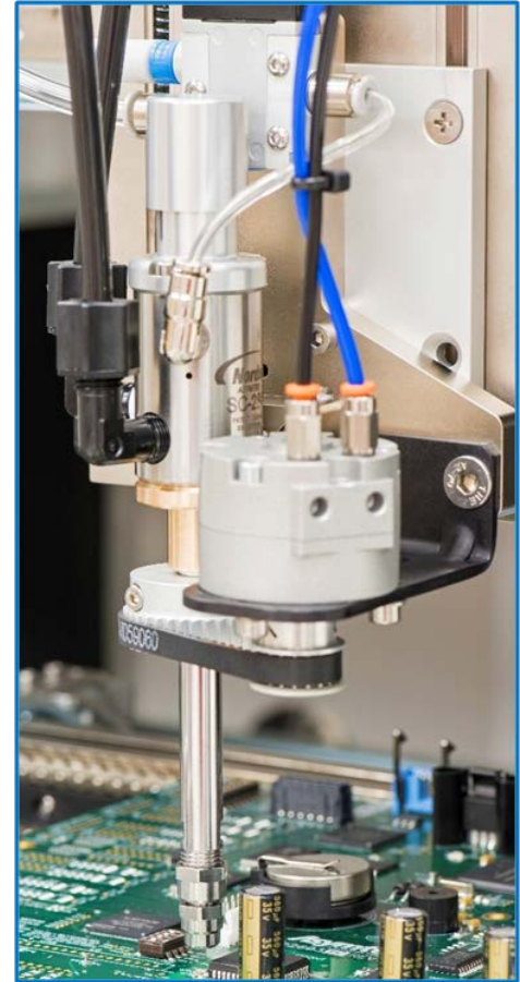
SC-280C Film Coater