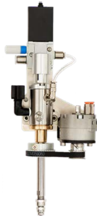
SC-280N Film Coater with Fourth Axis

The SC-280 applicators are intended for use with the Select Coat® SL-940 conformal coating system.