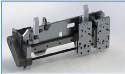
Dual-Simultaneous Programmable Pitch

For more information, visit our website to locate your local representative or contact your regional office: